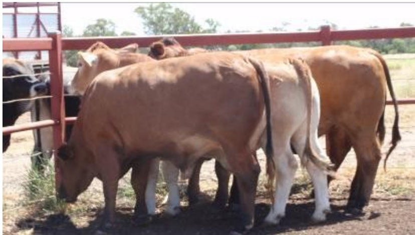
Some well finished Bazadai's X Steers

I am not a cattleman, I am not saying this is a perfect breed of animal, but from butcher's point of view, I do hope more cattlemen include the Bazadai's bloodline in their breeding program. I really believe they will reap the benefits, as will the butcher and ultimately, the consumer.