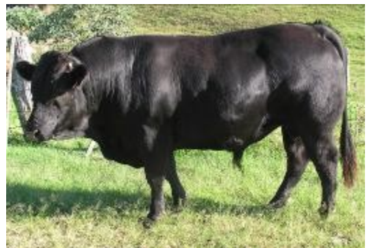
Big Ben Roy