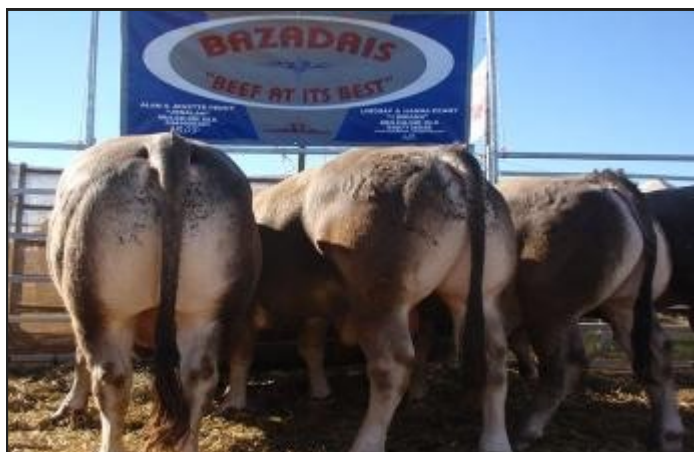
Emerald Ag Show Display