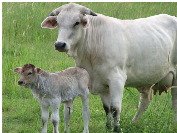
1 st cross Bazadais cow and 2 nd cross calf. Calf is one of the their first crossbreds the AI Bull of the cow was Polux