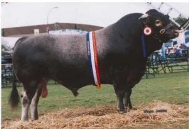
GARBROOK CONCIERGE 36 MTHS 890KG Fat Scan 9 / 6 EMA136

CATTLE FOR SALE AND INSPECTION IS ALWAYS WELCOME