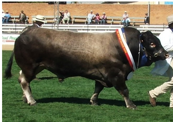
GARBROOK ZENITH 40 MTHS 1100KG Fat Scan 10 / 8 EMA156