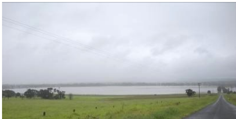
This was Lake Lindana Dec '09. Lindana just starts before the water line and goes back to the farm tree line.