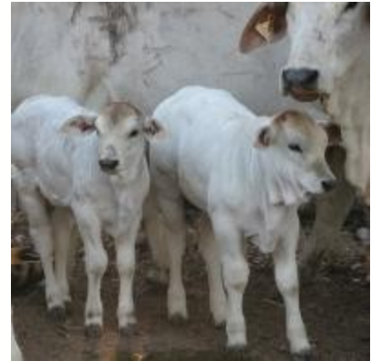
1 st cross Bazadais calves 3 to 5 weeks old